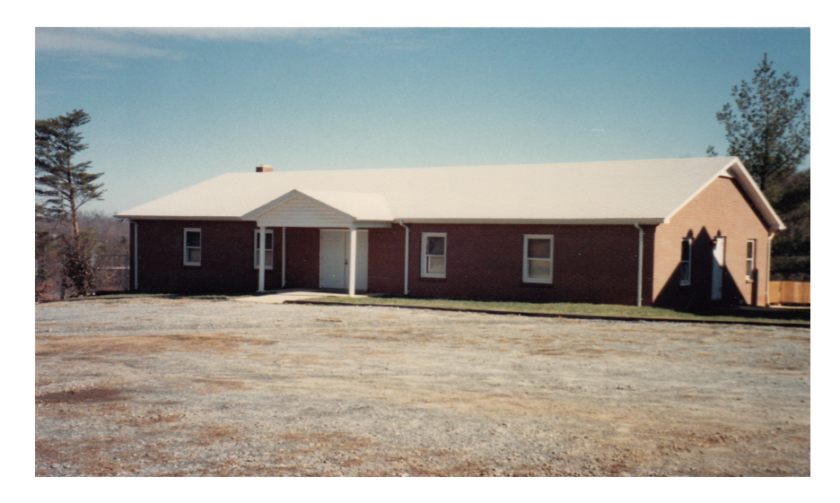
CHURCH REMODELING AND HANDICAP FACILITIES

We pledge that as we enter within its' walls, that we will conduct our activities and study of God's Word in a manner that will bring glory and honor to His name, that through this ministry, people of all ages may so learn of the love of God and Jesus, as Savior, that all may be prepared for the return of Jesus, as he comes again to be King of Kings and Lord of Lords, to rule the Kingdom of God on this earth.